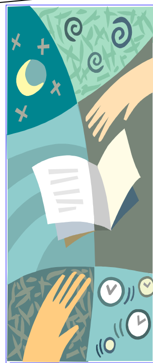
The school library holds a world of information your personal and academic needs.

Stop in the school library for more information.